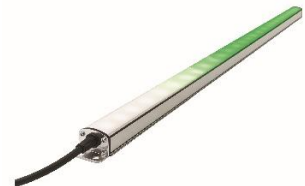
AR3 Indicator Strip