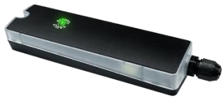
AR3 Wireless 2-Channel Door Sensor